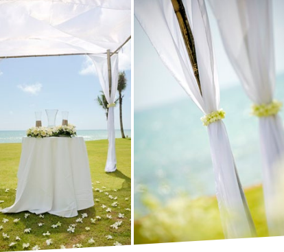
3 set-up styles to tie the knot: "True Love", "Sweetheart", "I Do."