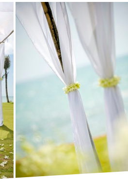
3 set-up styles to tie the knot: "True Love", "Sweetheart", "I Do."